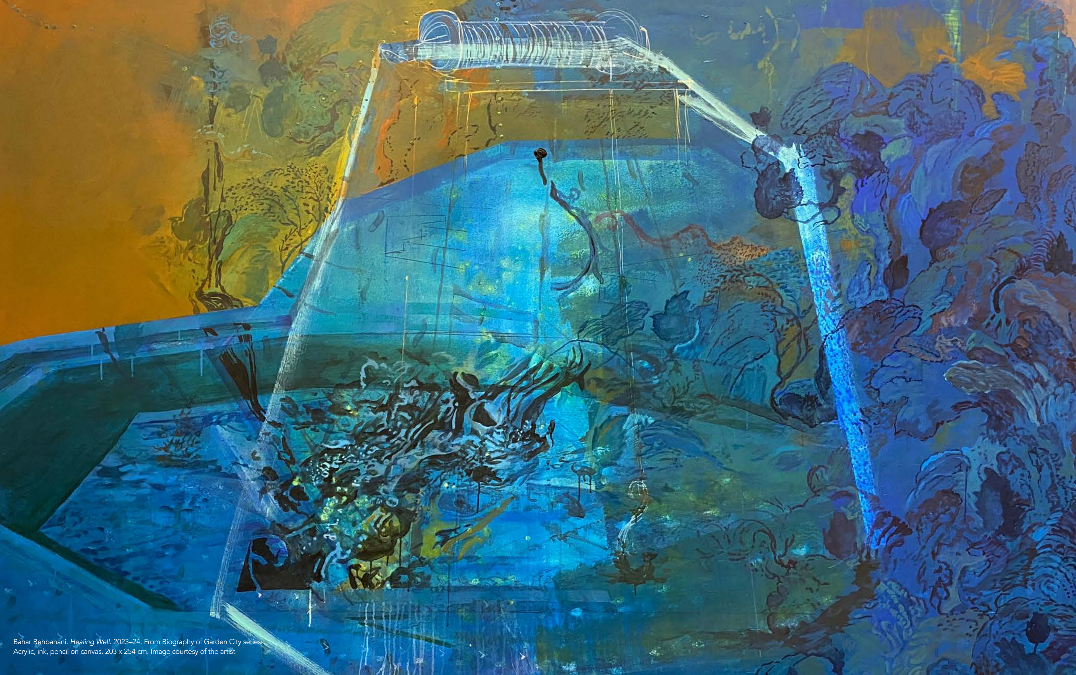
Bahar Behbahani. Healing Well . 2023–24. From Biography of Garden City series. Acrylic, ink, pencil on canvas. 203 x 254 cm.