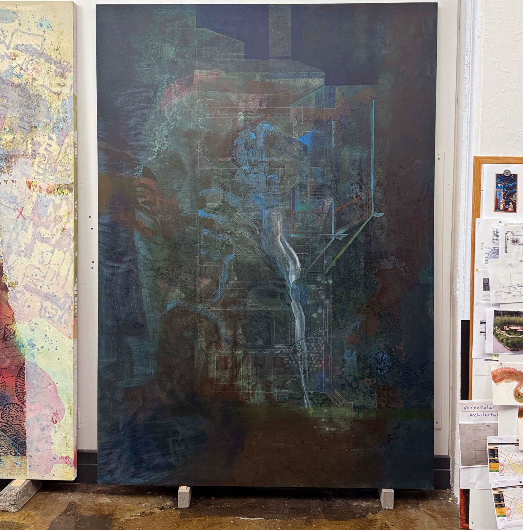
Bahar Behbahani's studio view with Underneath There Is A Waterfall , 2023–24. From the Biography of Garden City series. Mixed media on canvas. 254 x 178 cm.

discuss nature's own constant formation through waterways and how it resists systematic control over elements such as borders and migration.